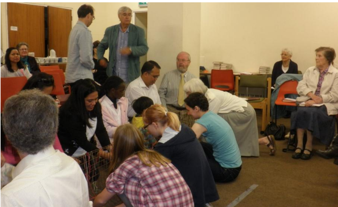
Services moved upstairs while the roof was being repaired